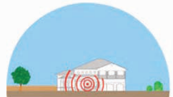
Typical Personal Emergency Response System's 2-way Voice Communication Range as speakerphone is in the Base Station

Voice Prompted System Provides voice announcements for set-up, testing, battery test and full system check